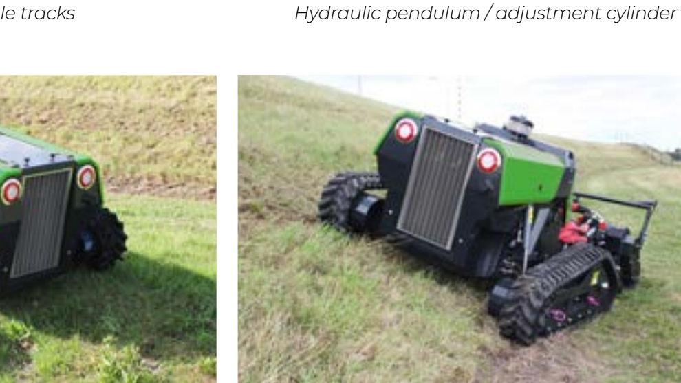
Independent swinging tracks for optimal ground following and grip