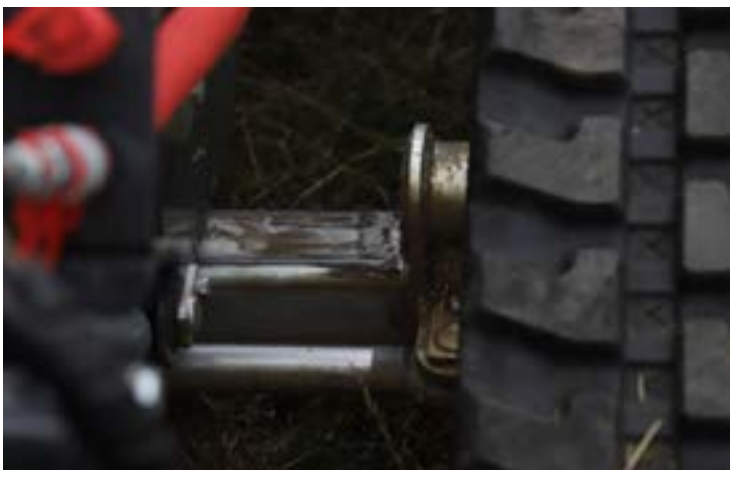
Width adjustable tracks