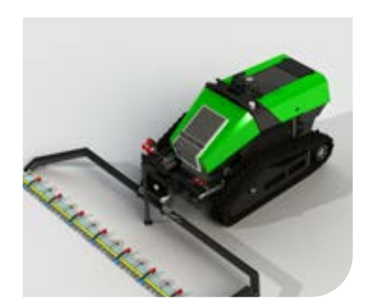
Portal mower with cutter bar