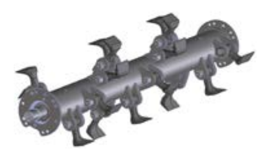
Standard flails for grass, branches and shrubs up to ø6-8 cm

With the Flail Mower you can choose from 3 different types of rotor shafts. Each rotor shaft has its own qualities, properties and application. Of course, you can always contact one of our experts, for further information and advisement.