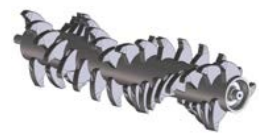
Forestry rotor with fixed chisels for branches and shrubs up to Ø10-12 cm